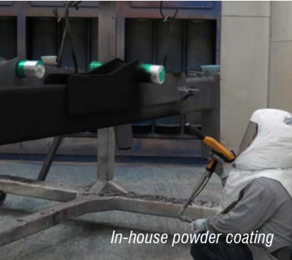
In-house powder coating