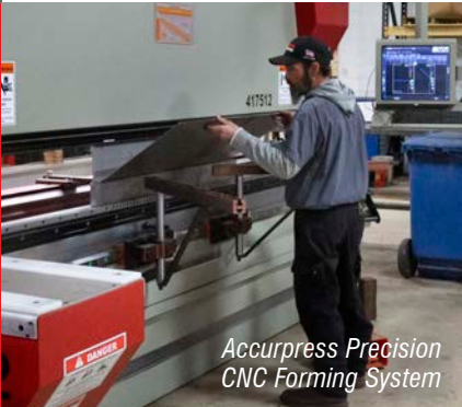
Accurpress Precision CNC Forming System