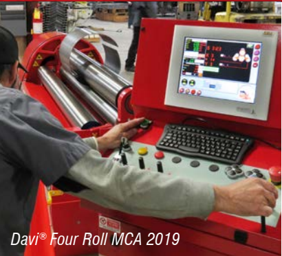
Davi® Four Roll MCA 2019

WELDED METAL ASSEMBLIES METAL FRAMES PRECISION METAL COMPONENTS CUSTOM