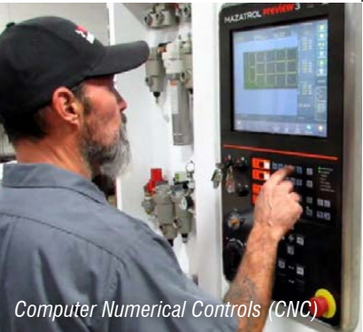
Computer Numerical Controls (CNC)