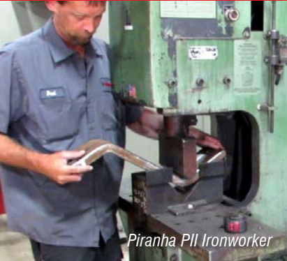
Piranha PII Ironworker