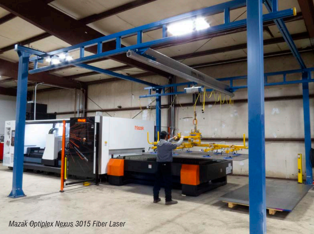
Mazak Optiplex Nexus 3015 Fiber Laser