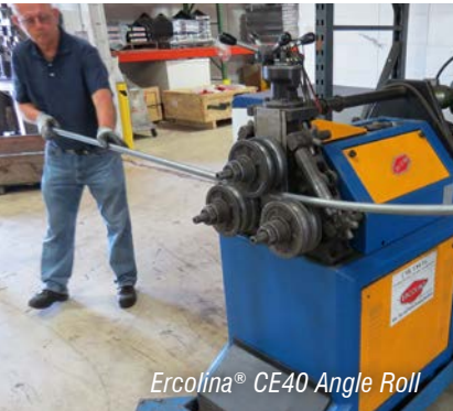
Ercolina® CE40 Angle Roll